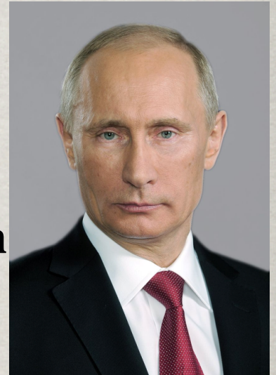
Vladimir Putin Владимир Путин

“Russia will take every necessary step of course and do everything within its power to settle the situation. I can understand the people in southeast Ukraine, who say that if others can do what they like in Kiev, carry out a coup d’etat, take up arms and seize government buildings, police stations and military garrisons, then why shouldn’t they be allowed to defend their interests and lawful rights?”