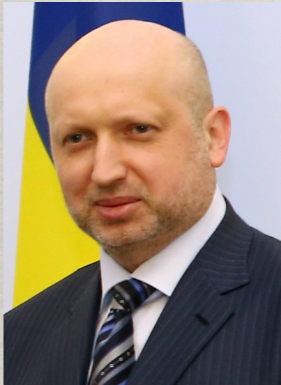
Oleksandr Turchynov Acting President of Ukraine

• The War is Intensifying to Irregular Warfare in the Separatists Regions – The Ukrainian Defense Ministry reported that seven paratroopers from Ukraine's 95 th Airmobile Brigade were killed and eight wounded in a military convoy attack near Kramatorsk on Tuesday May 12, 2014. Their convoy was ambushed by more than 30 men armed with machine guns and rocket-propelled grenades.