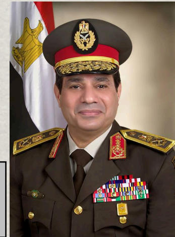
Field Marshal Abdel Fattah Saheed Hussein Khalil el-Sisi (born 19 Nov 1954) Commander-in- Chief of the Egyptian Armed Forces and defacto ruler of Egypt since the July 3, 2013 coup.