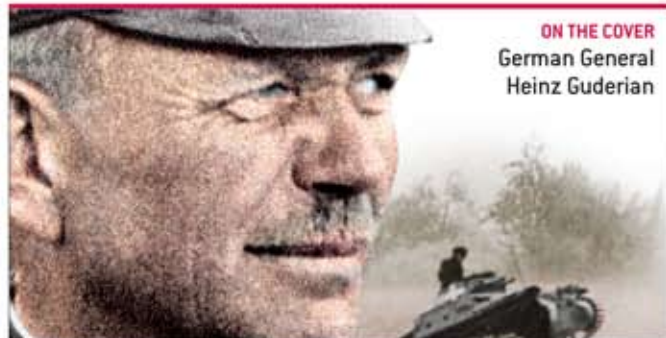
ON THE COVER German General Heinz Guderian