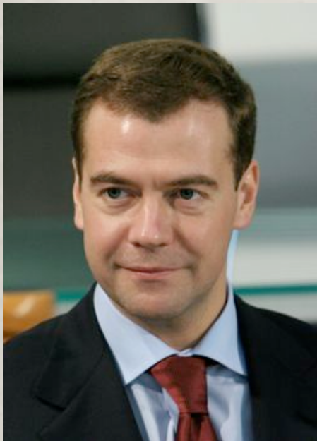
Russian Prime Minister Dmitry Medvedev

"There is foreboding of a civil war in #Ukraine," tweeted Russian Prime Minister Dmitry Medvedev on April 16, 2014.