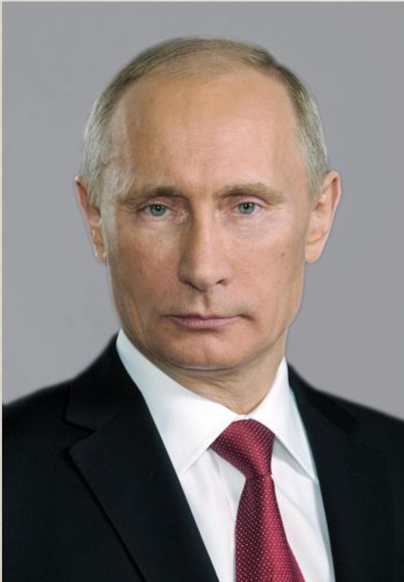
Vladimir Putin Владимир Путин

“The sharp escalation of the conflict essentially puts the nation on the brink of civil war,”