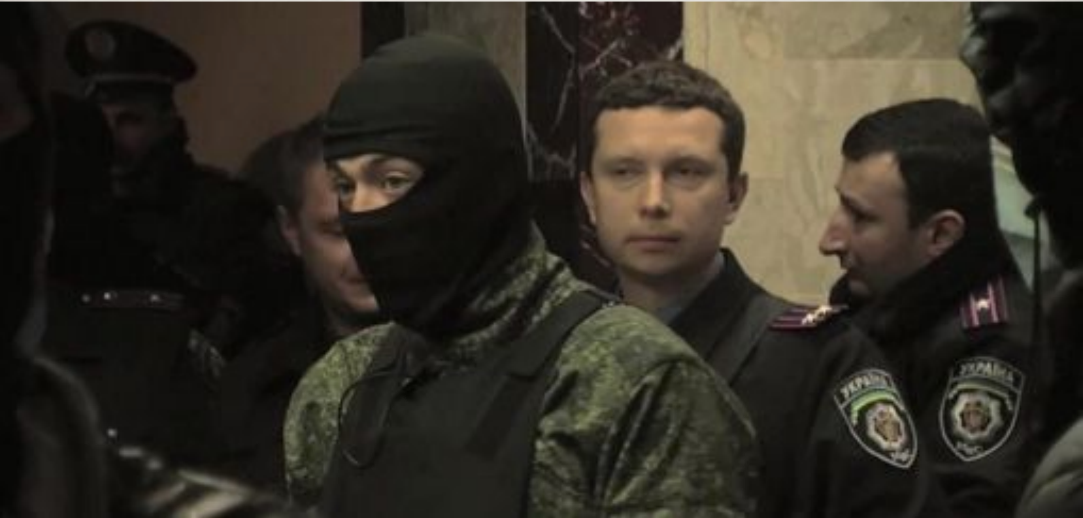
Pro-Russian militants in the Donetsk police headquarters, April 12, 2014.